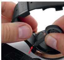
Illustration 1 and 2: removing the strap

The watches of the Gucci Dive collection are delivered with an additional strap, featuring an interchangeable system and specific tool to facilitate strap changes.