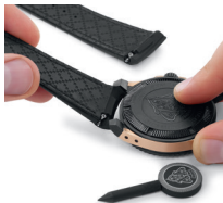
Illustration 3 and 4: fitting the strap